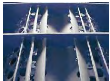
Screen with secondary crusher bars