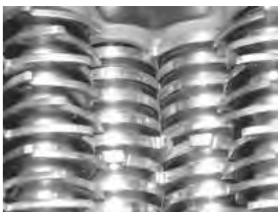
Cutting and clearing plates

GZ series four-shaft shredders are ideal to shred and recycle very long and oversized wood waste such as mature timber, long boards, pallets, packaging, and cardboard of any kind. Four-shaft shredders are mainly used in the wood processing industry.