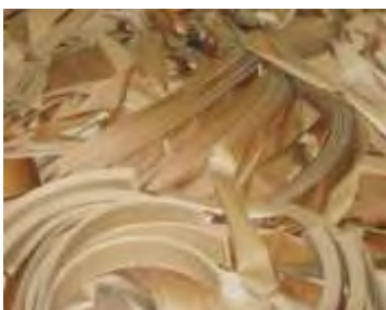
Waste from furniture manufacturing