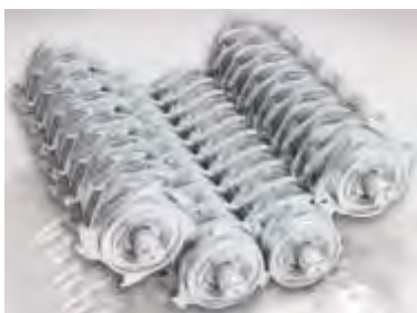
Cutting shafts (schematic)