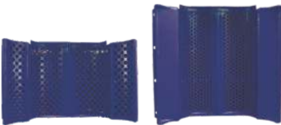
Screen with different perforation